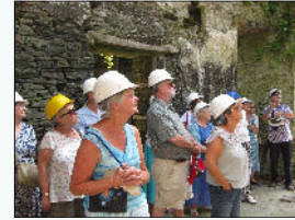
Visit to Cwrt Farm