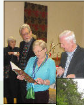
Friends' 100 Club draw

Help us to save this beautiful valley for everyone to enjoy today - and for generations to come.