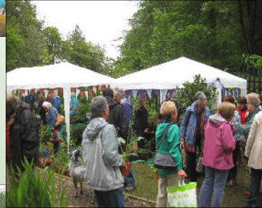
Fundraising Potting Shed Sale