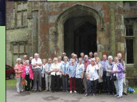
Visit to Stradey Castle